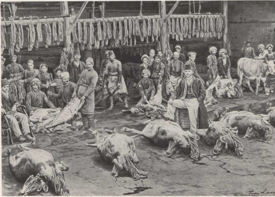
ARMENIANS PREPARING "BASTOURME," BEEF DRIED IN THE SUN, NEAR VAN